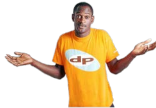
Do not know