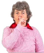
Prefer not to say