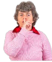
Prefer not to say