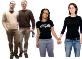
Gay or lesbian